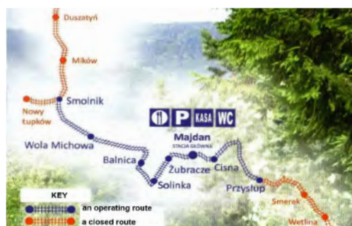
Integration of railways in the Polish-Slovak border region