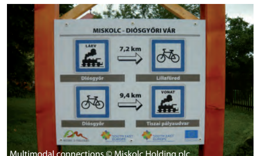
Multimodal connections