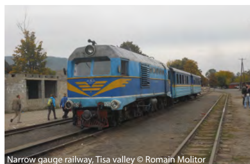
Narrow gauge railway, Tisa valley

The study identifies possibilities for combining narrow gauge railways and traditional railway lines as well as alternative transport routes in the Polish-Slovak borderland in an integrated system of multimodal transport . Thanks to the already existing infrastructure, the development of such a system would not be too costly. The most significant initiative seems to be a promotional campaign aimed at making the connection possibilities more popular with a common tariff policy for carriers, thus making travelling through the borderland region more convenient. The analysis also calls for increased cooperation and partnerships between transport bodies and local authorities.