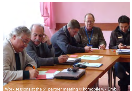
Work sessions at the 6 th partner meeting