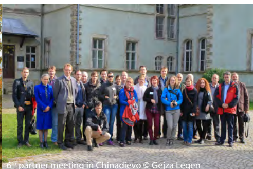
6 th partner meeting in Chinadievo