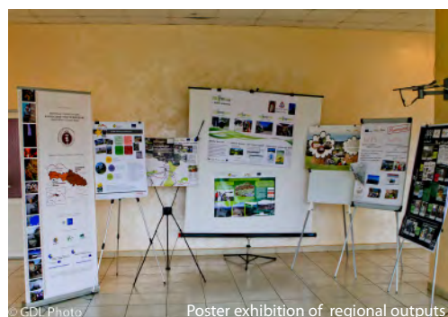
Poster exhibition of regional outputs