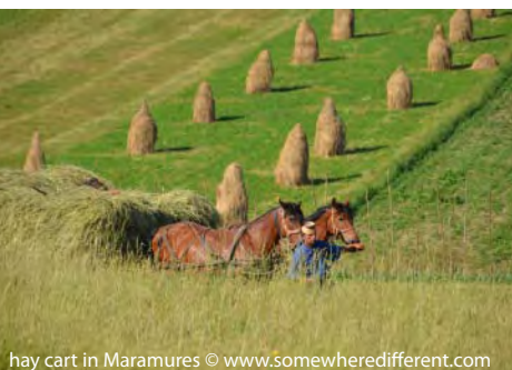
hay cart in Maramures