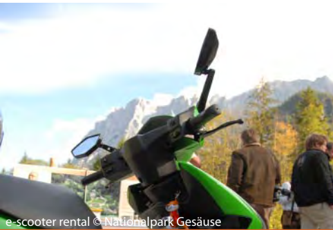
e-scooter rental