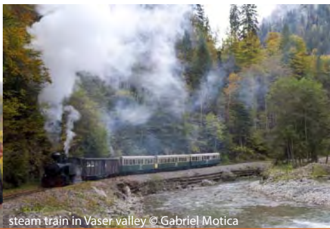
steam train in Vaser valley