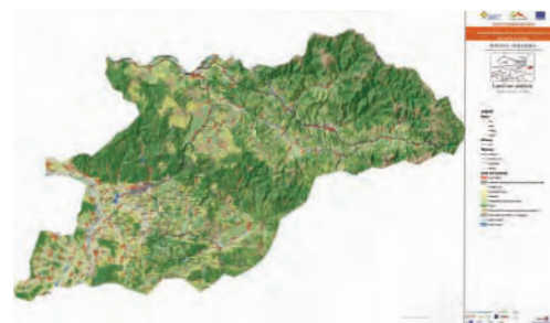
regional data modelling