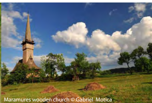
Maramures wooden church