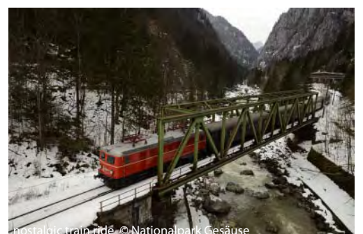
postalgic train ride