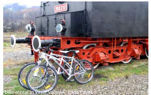
bike rental in Vaser valley

Meanwhile, visible action is being taken by Miskolc Holding who are providing covered cycle racks at railway stations - to be followed by further measures to facilitate the combined use of bike and train as transport options.