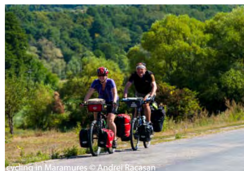
cycling in Maramures