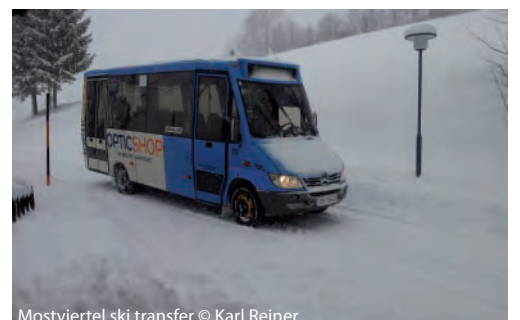
Mostviertel ski transfer © Karl Reiner