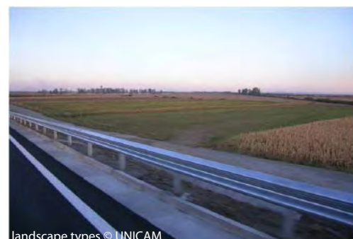
landscape types